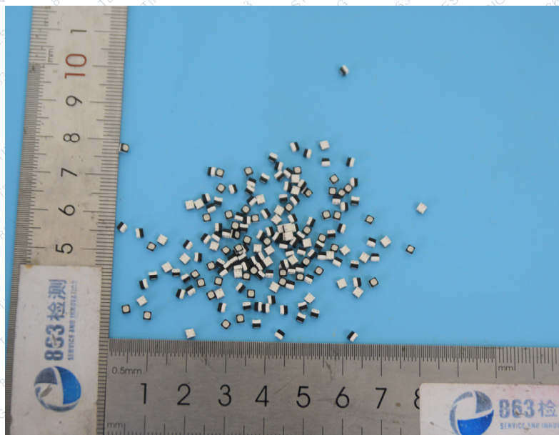
Photo of the sample